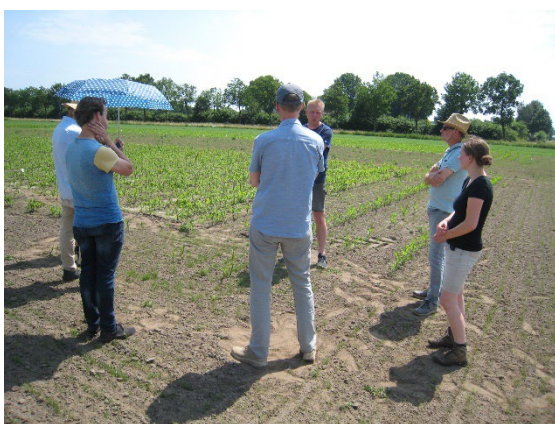
Figure 13 Participants and field trial view (WENR, 2021).