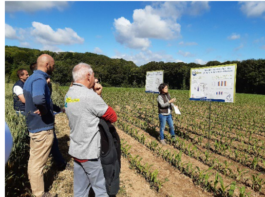
Figure 8 Presenting N stripping pilot and results for FR-AS in 2021 (CRAB, 2022).