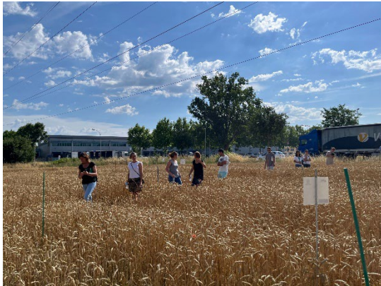
Figure 1 Field trial view (UVIC, 2022).