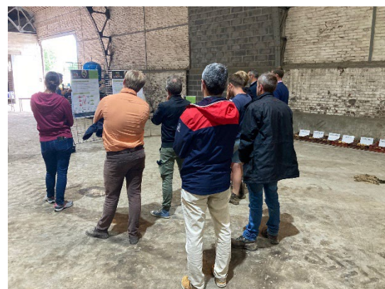
Figure 12 Participants (CA-80, 2023).