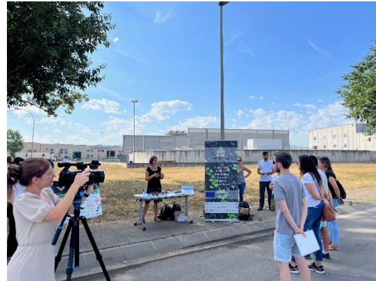
Figure 2 Participants to field trial visit (UVIC, 2022).