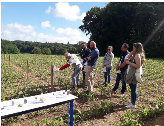
Figure 9 Participants (CRAB, 2022).