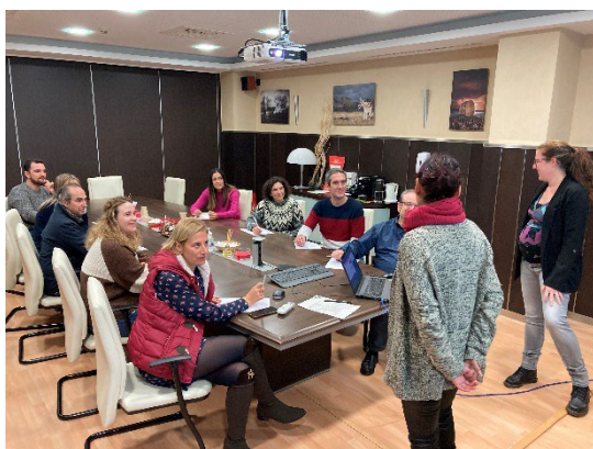
Figure 5 Participants to FERTIMANURE event (Fertinagro BioTech, 2022).