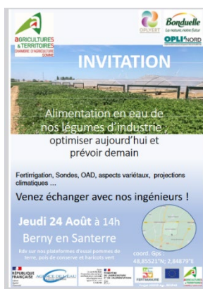
Figure 10 Invitation to the event (CA-80, 2023).