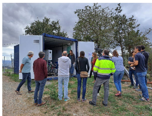
Figure 4 Presenting the Spanish pilot (UVIC, 2023).