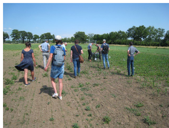
Figure 14 Participants and field trial view (WENR, 2021).