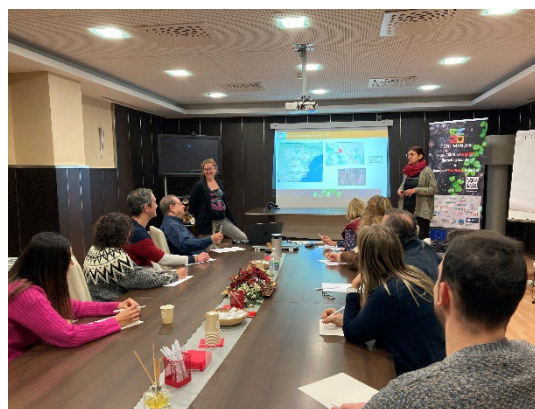
Figure 6 Presenting the location of the field trials (Fertinagro BioTech, 2022).