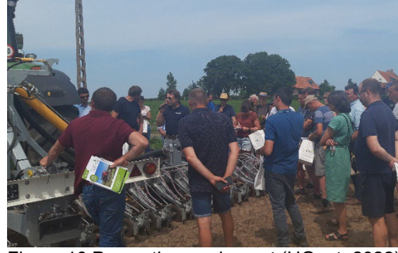
Figure 16 Presenting equipment (UGent, 2022).