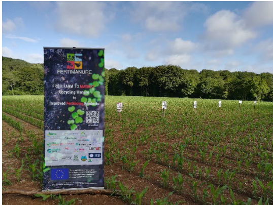
Figure 7 Field trial view (CRAB, 2022).