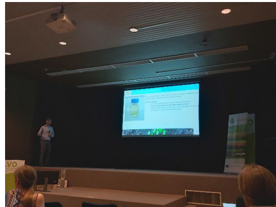
Figure 20 Presenting BBF tested in the field trials (UGent, 2023).