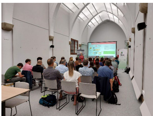
Figure 3 Presenting the project (UVIC, 2023).