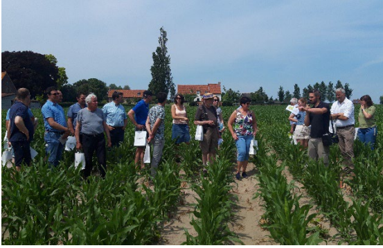
Figure 15 Visiting the maize field trial (UGent, 2022).