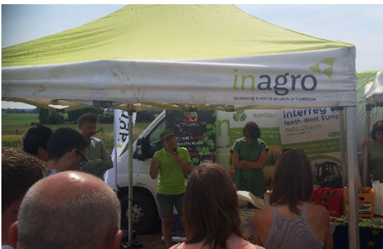
Figure 17 Presenting FERTIMANURE project (UGent, 2022).