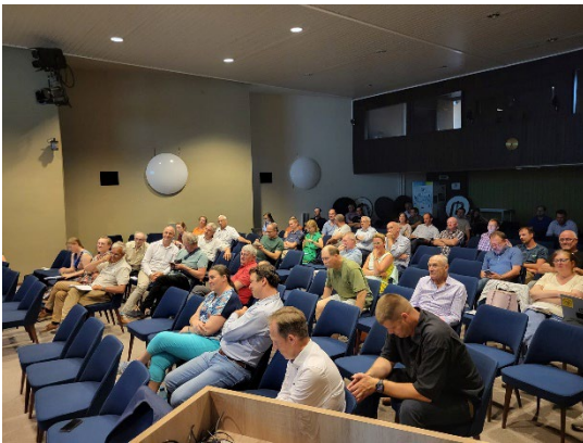
Figure 19 Participants (UGent, 2023).