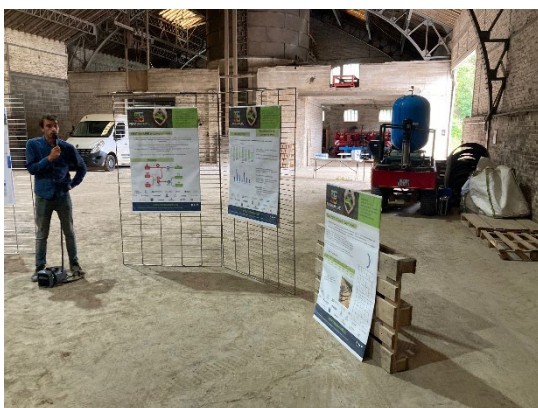
Figure 11 Presenting the FERTIMANURE project (CA-80, 2023).