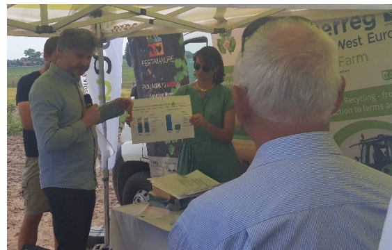
Figure 18 Presenting results from 2021 (UGent, 2022).